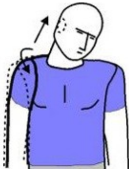
Posterior Shoulder Stretch