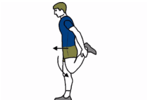
Hip Flexor Stretch