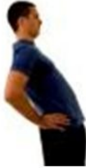
Standing Back Flexion Stretch